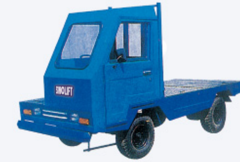
SH-2DB-CM SH-3DB-CM SH-BD3-CM