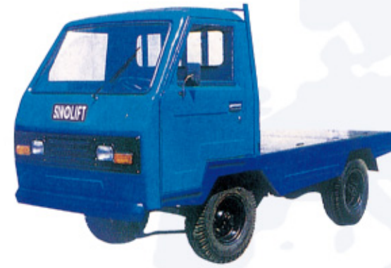
SH-2DB-M SH-3DB-M SH-4DB-M SH-5DB-M

The frame of the truck is very strong, and the platform is a non skid chequered plate.