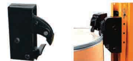
Automatic grip lock