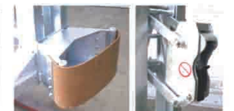
Crashworthy block and Automatic grip lock